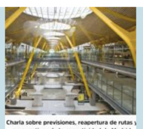
Charla sobre previsiones, reapertura de rutas y perspectivas de la conectividad de Madrid